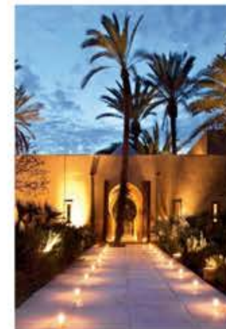
Door of serenity: the gardens of La Palmeraie are bathed in the warm evening light