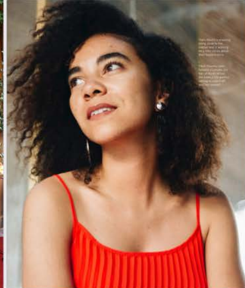
She's beautiful in every- thing, could be the most beautiful one of them all. She's the one who's not just a woman, but a queen.